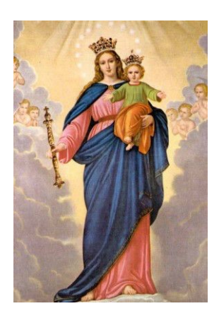
Prayer of Entrustment of Australia to Immaculate Mary, Our Lady Help of Christians

O Immaculate Mary, Help of Christians, Queen of Heaven and Earth, and tender Mother of humanity, at this time when a pandemic threatens all of your children, we entrust to you our nation, Australia, and all who live in this country.