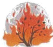
The Burning Bush

This year funds raised will support Streetlight Community, an Adelaide-based outreach supporting our city's youth. Streetlight has started working in Onkaparinga, using volunteers from local churches to build relationships and support the city's youth.